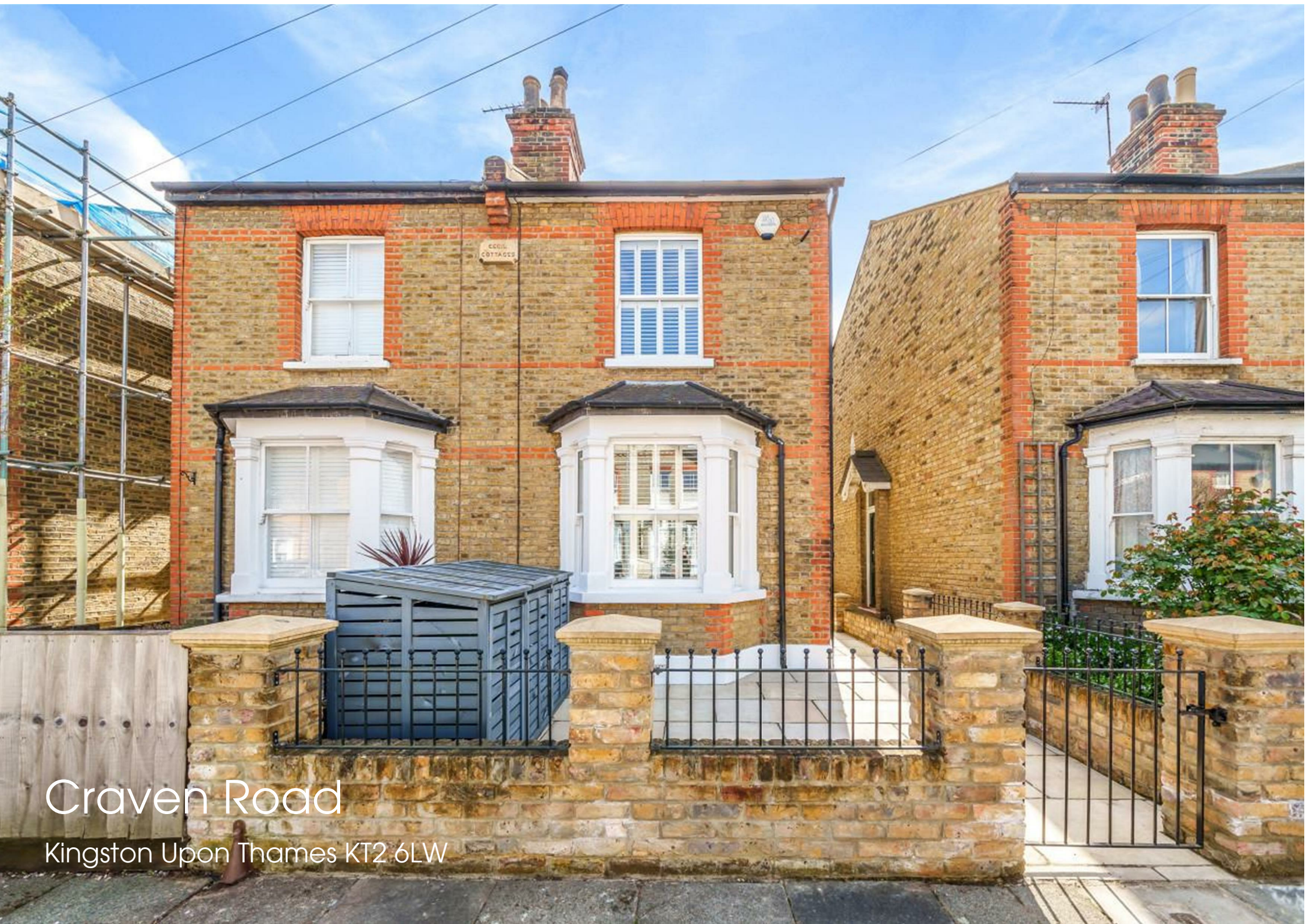
Craven Road Kingston Upon Thames KT2 6LW